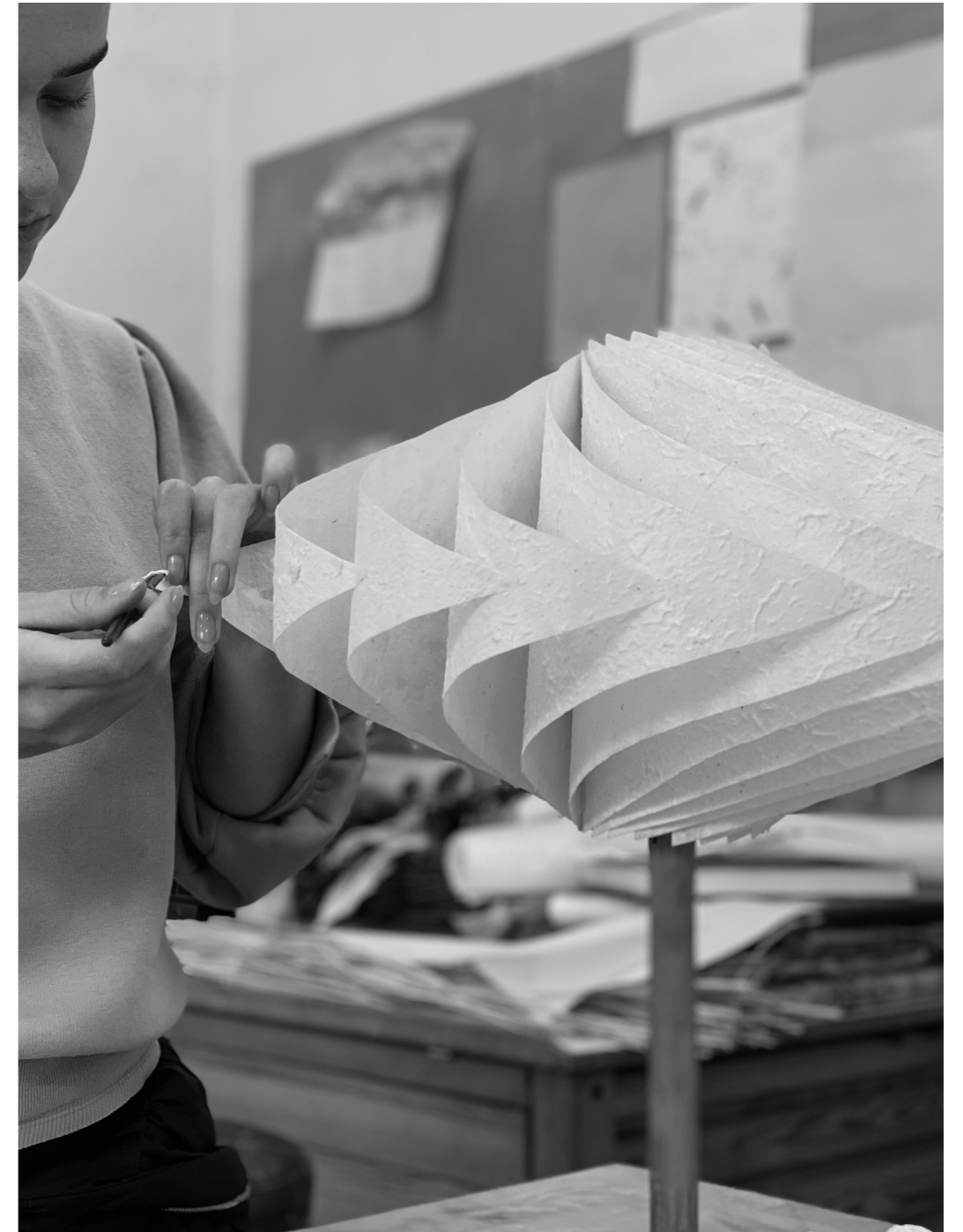
Materials: Kozo (washi)

A selection of paper lamps developed between 2021–2024.