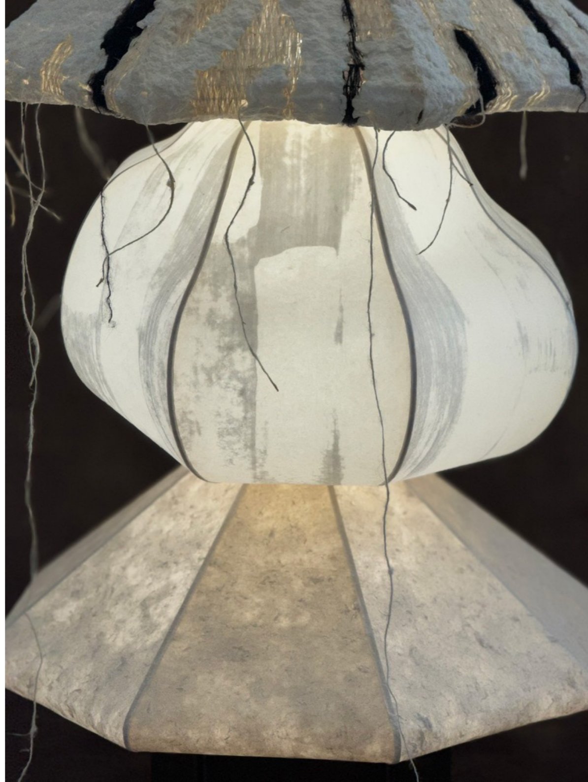
Lampshade materials: Kombucha leather, clothpaper, beeswax, wool

Collab: MA project with Amalie Ege, Spinderihallerne Bio lab 2025