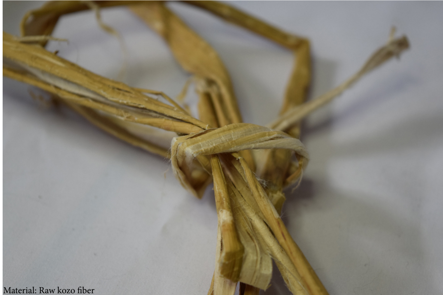
Material: Raw kozo fiber

NATALIEDUPONT.ATELIER@GMAIL.COM Havnegade 100 Odense C 5000 TLF. (+45) 28296052