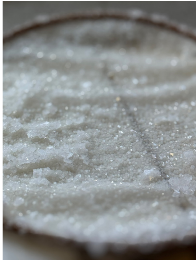
Saltcrystals on paper Collab: MA project with Amalie Ege, Spinderihallerne Bio lab 2025

These experiments extend my research into the biomaterial field. Salt crystals grown on handmade paper, kombucha leather sheets and textile-pulp hybrids demonstrate how natural processes can co-create form. The materials are not static; they evolve, grow and transform over time.