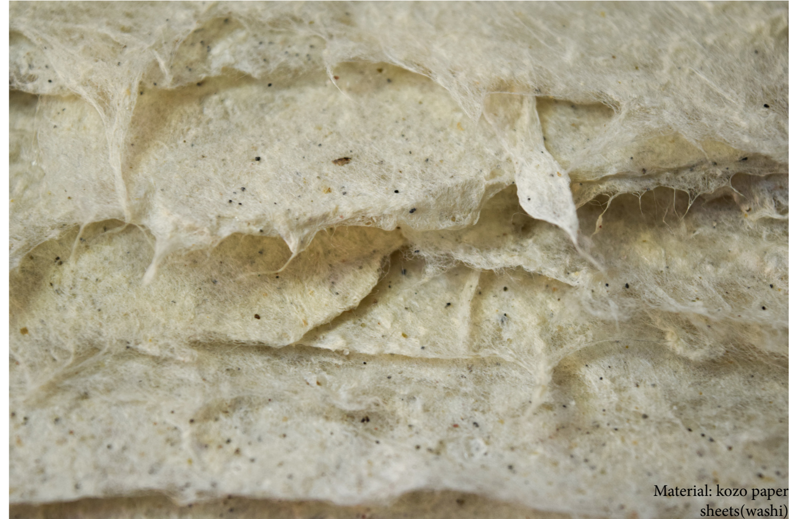
Material: kozo paper sheets(washi)

These sheets represent the foundation of my practice. Each fiber is processed, beaten and formed by hand by me, using kozo and recycled cotton textiles. The sheets show the material's raw character and the subtle variations created through water, gravity and slow drying. They are the starting point for all my sculptural and lighting work.